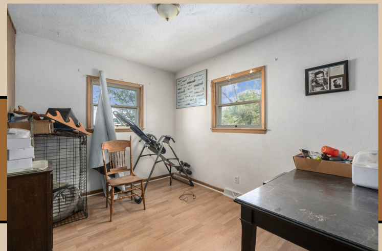
The information contained in this brochure is from reliable sources and is believed to be correct, but is NOT guaranteed.